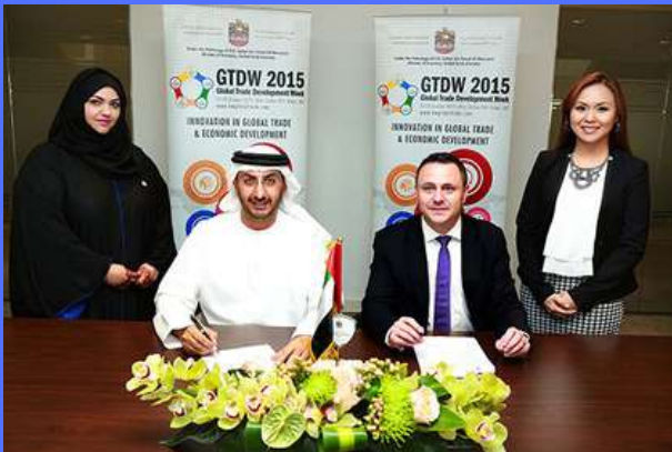
MOU Between UAE Ministry of Economy and KW Group