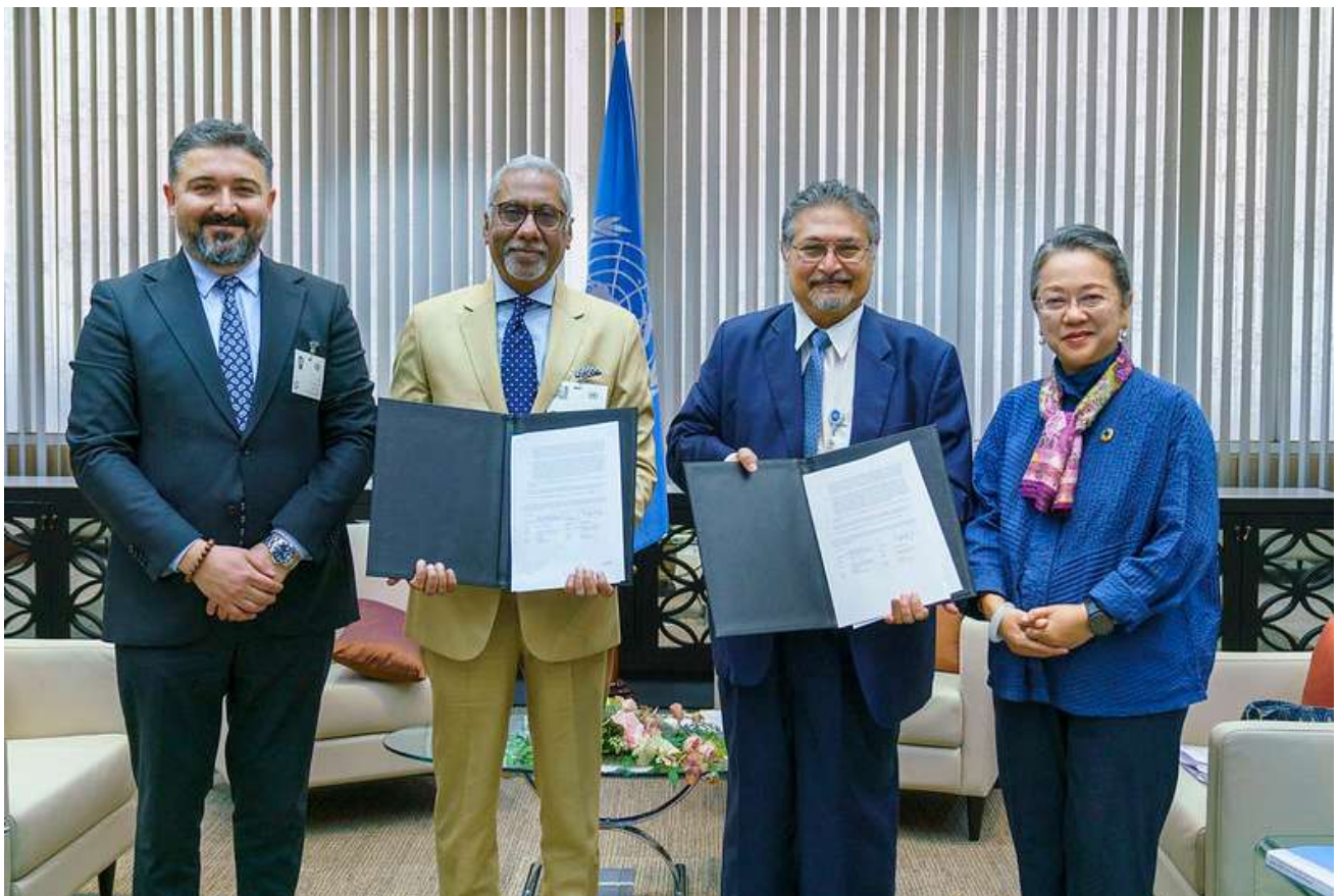
WAIPA & UN ESCAP Sign 2 Year MOA, Organized By KW Group

KW Group's collaboration with UN ESCAP extends across several key areas related to the UN Sustainable Development Goals, including inclusive trade, gender equality, and climate-focused FDI training and development. By working together, KW Group and UN ESCAP aim to promote sustainable investment and trade practices that benefit both the region's economy and its communities.