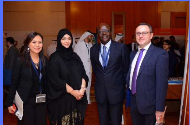
UAE Ministry of Economy & KW Group hosting Dr Mukhisa Kituyi, Director General UNCTAD