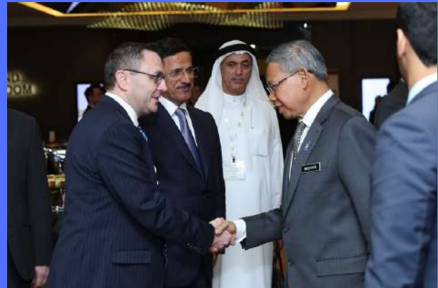
Bilateral Trade Ministers meeting between UAE & Malaysia organised by KW Group