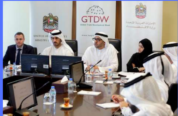
Press Conference KW Group with UAE Ministry of Economy & Federal Customs Authority