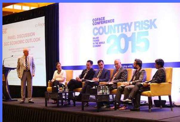
KW Group organised COFACE Middle East Country Risk Conference for 400 Trade Finance Professionals