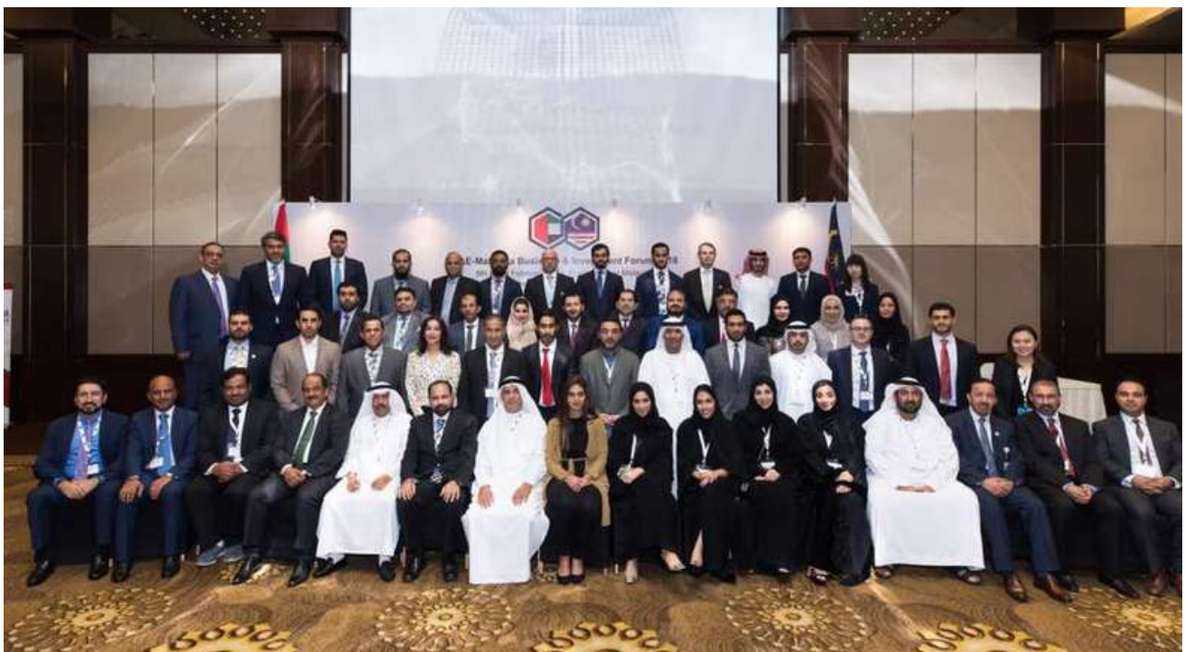
UAE DELEGATION TO MALAYSIA 2018