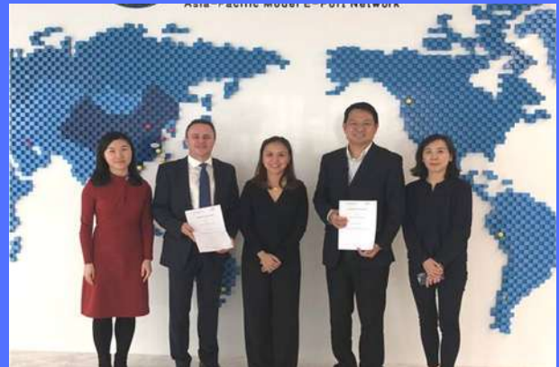
MOU Signing between APMEN, China & KW Group