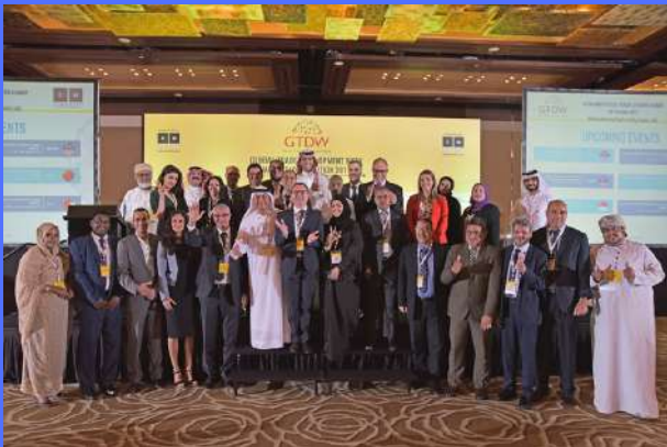
Islamic Development Bank, Arab Ministers Meeting hosted by UAE Ministry of Economy & KW Group