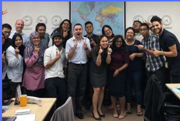
KW Group Team