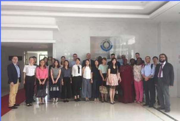
Trade Facilitation Capacity Development Program hosted at Shanghai Customs College